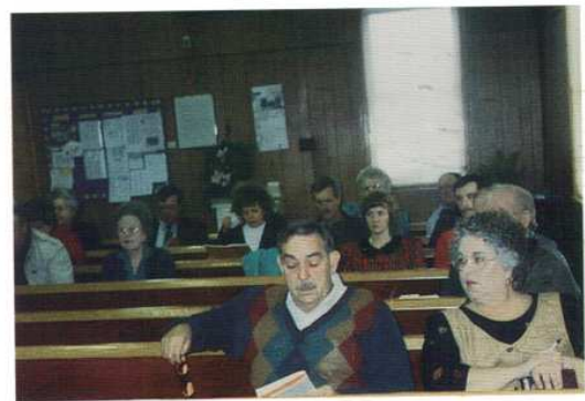
Adult Bible Study Class