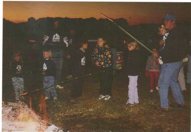
After hayride wiener roast