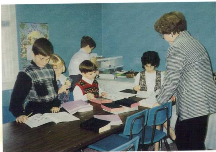
Intermediate Bible Study Class