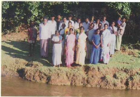
Candidates for Baptism Rajahmundry, India