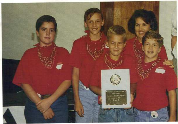
1994 & 1995 Bible Bowl Winners