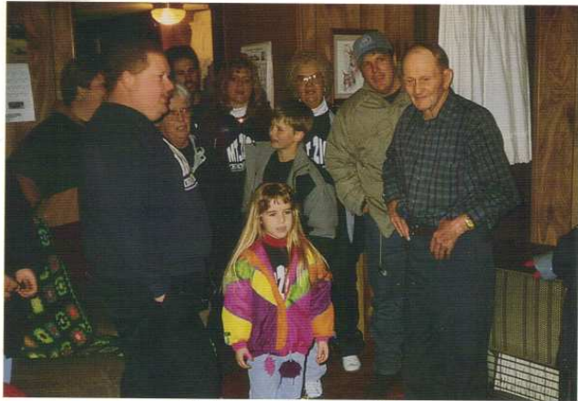
Christmas Carolers 1996