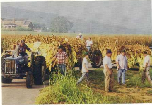
Neighbors helping neighbors over 100 volunteered