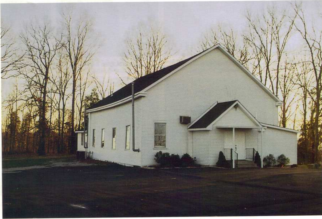
Mt. Zion Church of Christ

Mt. Zion Church of Christ and adjacent cemetery is located on Mt. Zion Road near Richardsville, Warren County, Kentucky. The building is in a picturesque and peaceful spot on a high bluff overlooking Barren River about one mile downstream from the old Greencastle locks and dam.