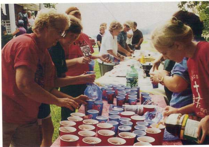
Body & soul was in a time of need